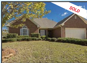
The Narrows - Sold!

I have lived on Hwy 280 for the past 15 years and can help you (or your friends) buy a home or sell a home!