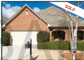
The Narrows - Sold!